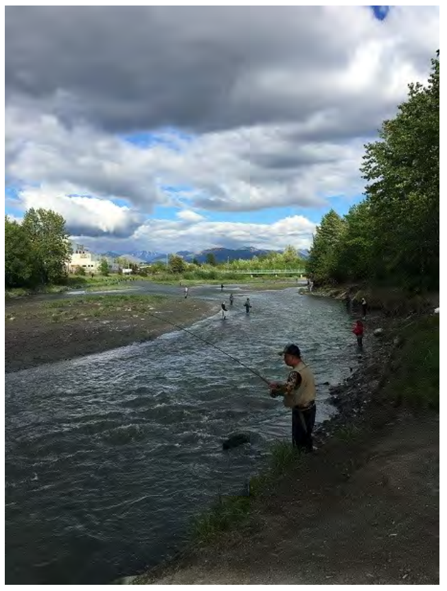
Fishing in Alaska

Welcome to Centers for Disease Control and Prevention's (CDC) tribal resource digest for the week of August 14, 2017. The purpose of this digest is to help you connect with the tools and resources you may need to do valuable work in your communities.