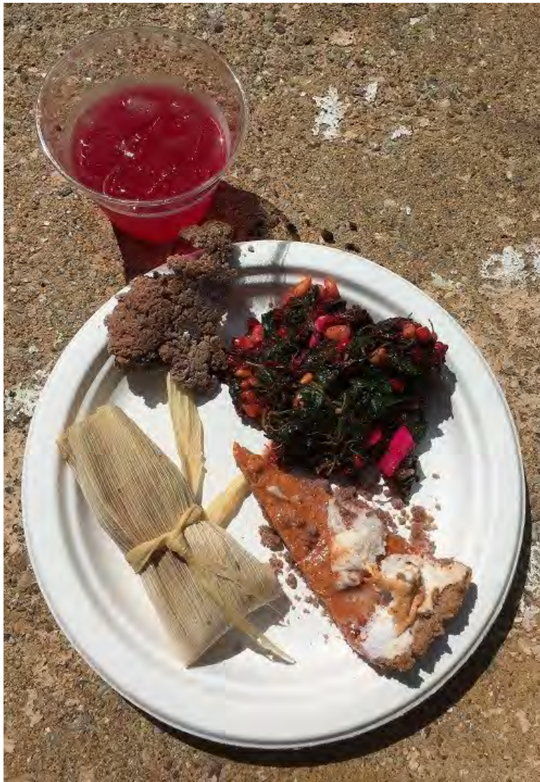
All ingredients are part of the Traditional Apache Diet Project and harvested in the surrounding desert areas of San Carlos Apache Tribe reservation