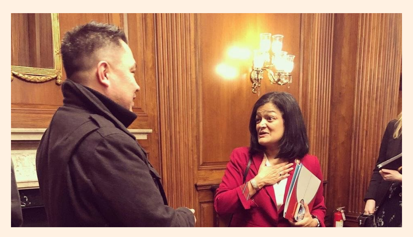
Hill visit Feb 2020