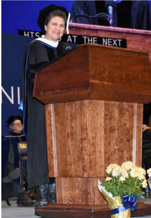
Commencement address Fall 2018