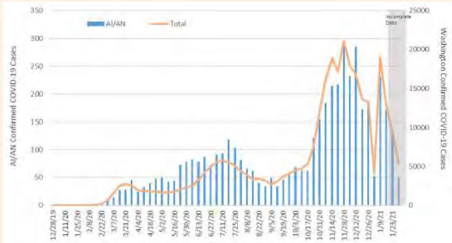
EpiCurve of COVID-19 Cases by Week