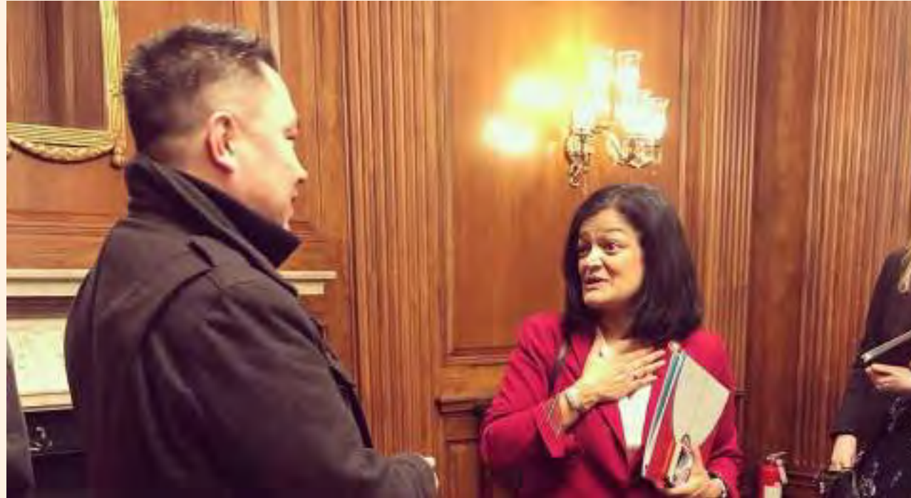
Hill visit Feb 2020