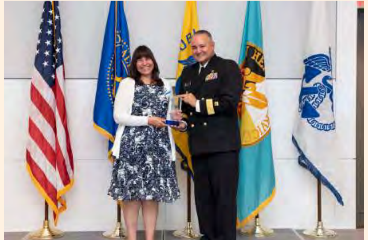
Photo taken from IHS 2018 Awardees Pre-Ceremony.