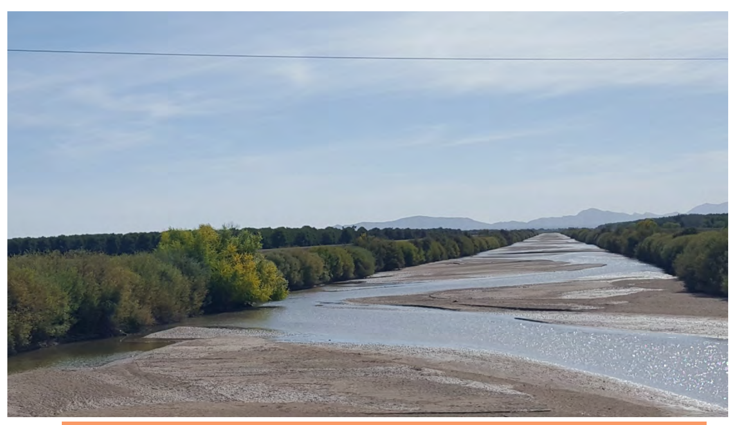
October 2017— Just south of Las Cruces, NM