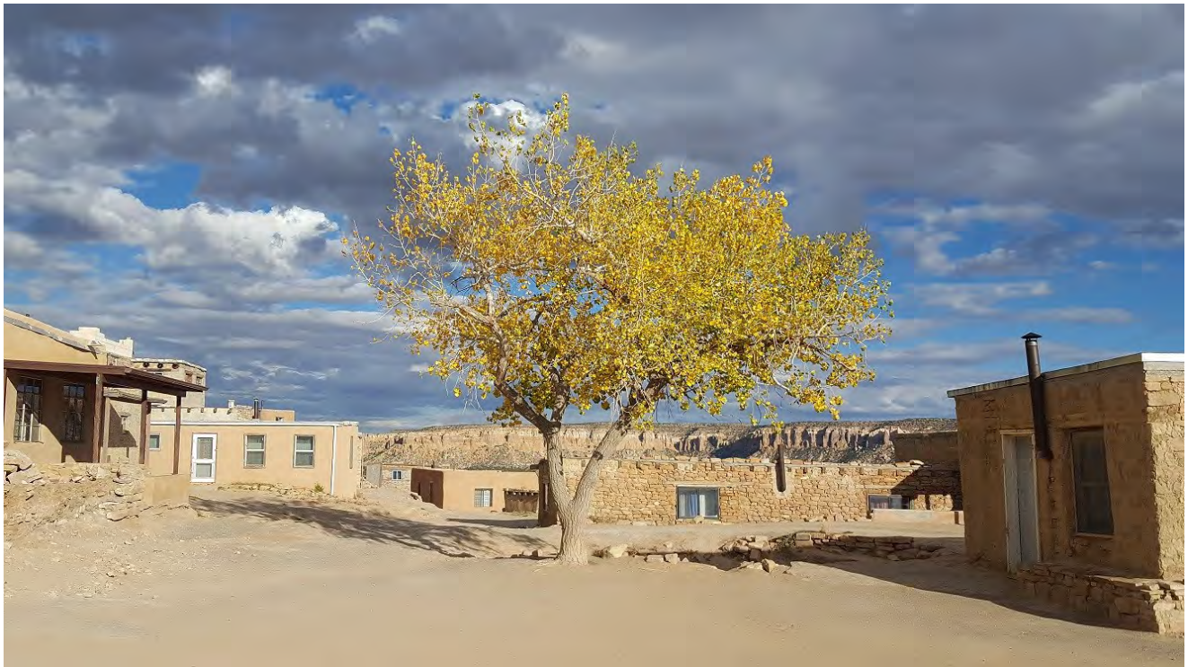
Lone Tree at Acoma Pueblo

Welcome to Centers for Disease Control and Prevention's (CDC) tribal resource digest for the week of February 6, 2017. The purpose of this digest is to help you connect with the tools and resources you may need to do valuable work in your communities.