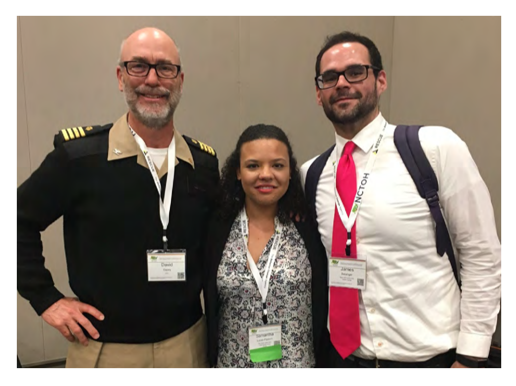
2017 National Conference on Tobacco or Health

Welcome to Centers for Disease Control and Prevention's (CDC) tribal resource digest for the week of March 27, 2017. The purpose of this digest is to help you connect with the tools and resources you may need to do valuable work in your communities.