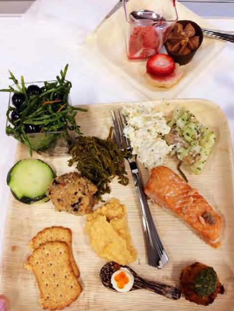
Traditional foods (with a few exceptions) served at the Culture Night at the NIHB Public Health Summit in Anchorage, AK

Welcome to Centers for Disease Control and Prevention’s (CDC) tribal resource digest for the week of June 26, 2017. The purpose of this digest is to help you connect with the tools and resources you may need to do valuable work in your communities.