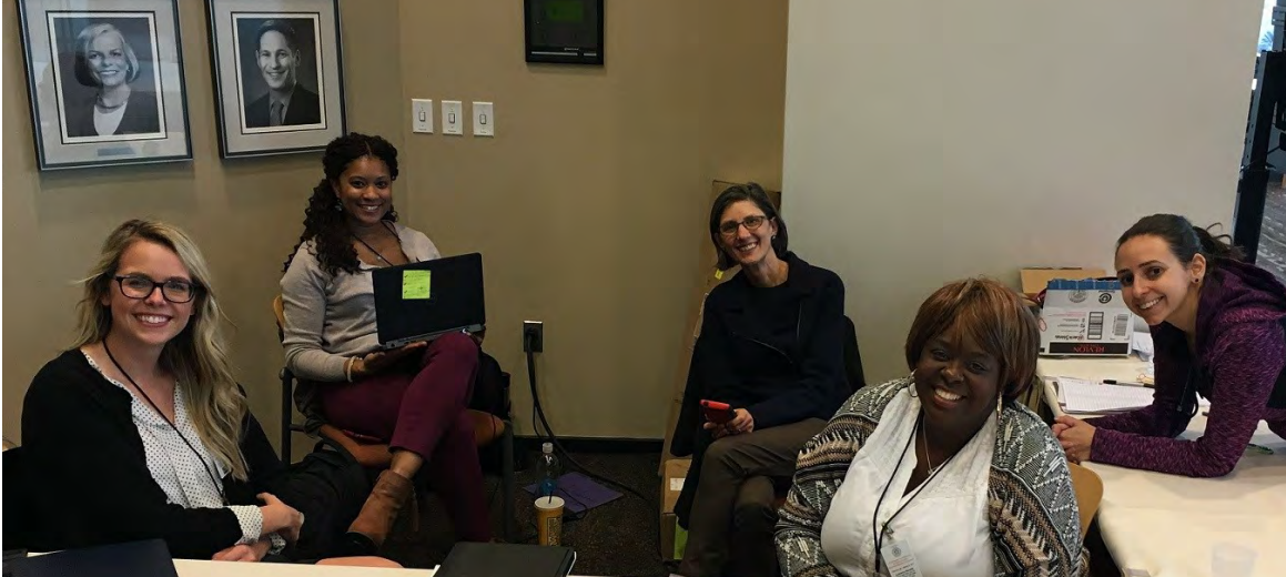
GHWIC Mid Point Grantee Conference

Welcome to Centers for Disease Control and Prevention's (CDC) tribal resource digest for the week of March 20, 2017. The purpose of this digest is to help you connect with the tools and resources you may need to do valuable work in your communities.