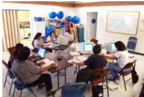
Toiyabe Indian Health Project September 19th & 20th, 2001