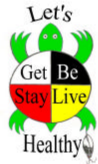
Colville Diabetes Prevention Program Logo