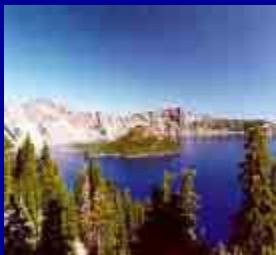
Crater Lake, OR Near Klamath Tribe

Diabetes Management System Training Information 4