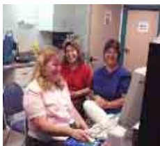
Greenville Rancheria and Red Bluff Staff October 1st and 2nd, 2001