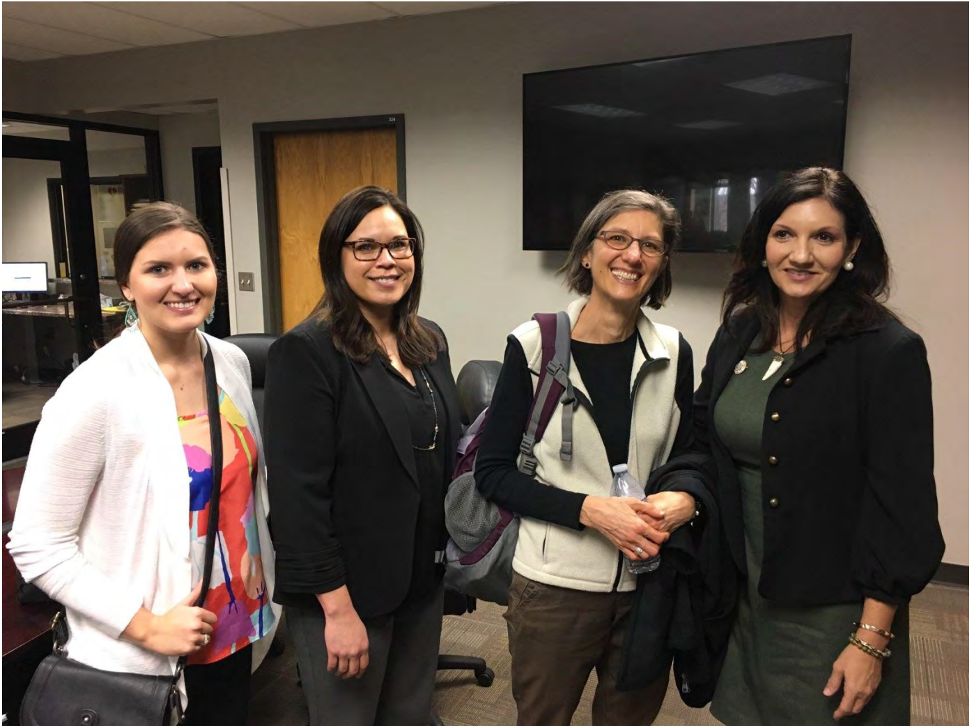
Site Visit to Cherokee, Oklahoma