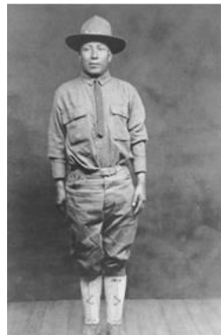
Tobias Frazier World War I code talker

Prior to World War I, American Indians had served as guides, interpreters, scouts, mostly as contractors, to the growing number of European colonists since the 1600s and their warriors fought alongside the new Americans in every war. If they were enlisted into the Regular forces at all, it was only for very short periods, and they didn't receive veterans benefits because they weren't citizens. However, some successfully obtained disability pensions through special acts of Congress.