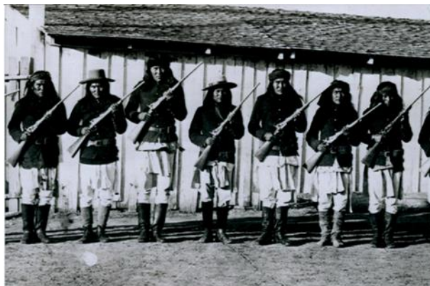
Apache scouts at Fort Wingate, N.M., 1891

Scouts furnished their own horses, guns, and ammunition, and received food rations for themselves, their families, and their horses as part of their pay. Most scouts were paid in goods, such as blankets or supplies, instead of cash. They did not receive government benefits unless authorized through treaties or individual acts of Congress. In 1842 several Cherokee warriors received federal pensions for their services during the War of 1812. It was not until 1858 that the heirs of Richard Farren, “a friendly Creek Indian” who also provided services during that war, were paid $600 for their loss. During the Civil War, Indian scouts served in segregated regiments on both sides along with Union and Confederate volunteer and Regular forces.