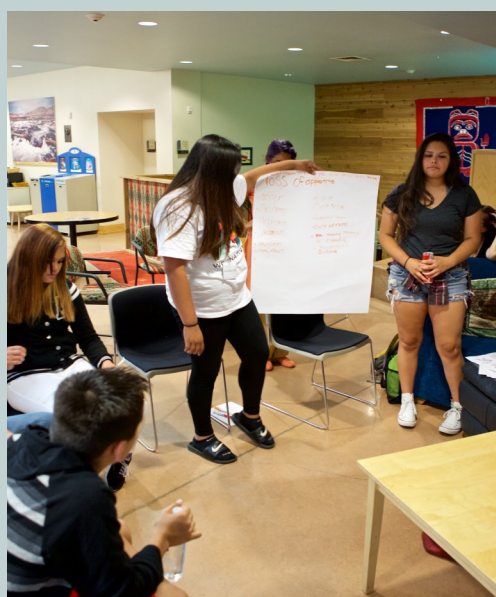
Native youth at THRIVE Conference.

Native STAND is a comprehensive culturally-appropriate curriculum for Native American high school students that promotes healthy-decision making. The curriculum is intertribal, drawing on teachings from many tribes and communities across the country. Native STAND focuses on positive youth development to support the prevention of sexually transmitted infections, HIV/AIDS, and to prevent teen pregnancy. The curriculum also addresses drug and alcohol use, suicide and healthy relationships. Native STAND is highly interactive.