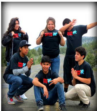
Native STAND youth on field trip.

Students Together Against Negative Decisions