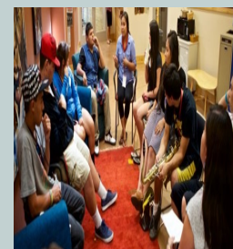
Hands-on training.

Participation in this project is open to all Tribes and AI/AN organizations across the United States.