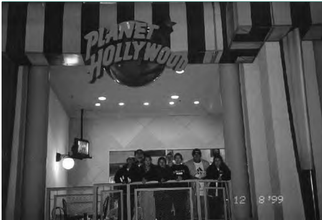
The youth participants and chaperones at the “Youth PathsXI” and “Youth Wellness & Leadership Institute V” conferences take a moment to get familiar with San Diego.