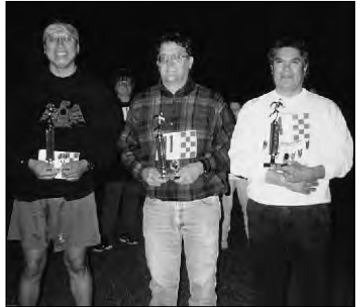
Official winners of the Fun Run/Walk, the unofficial winner is the community for encouraging healthy lifestyles!