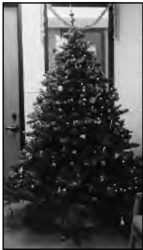
Oh, Christmas tree! Oh, Christmas tree...