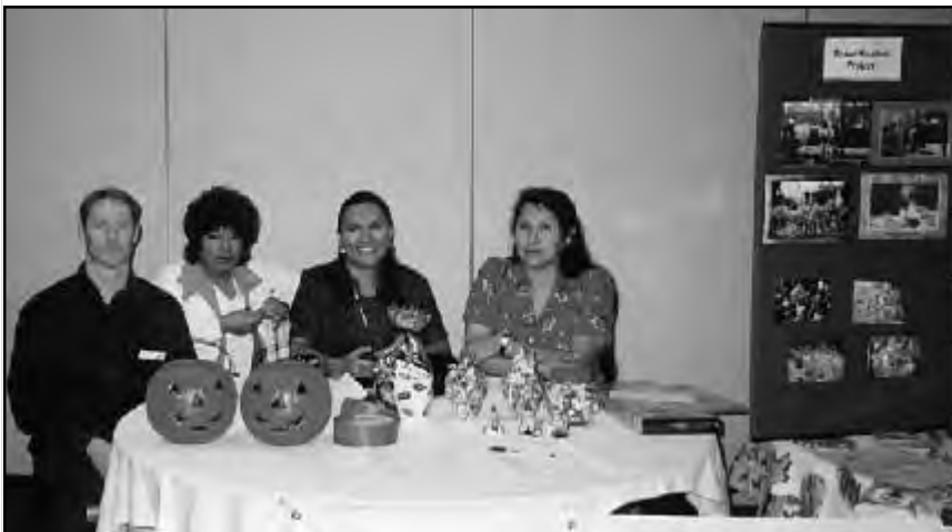
The Community Health Representatives did a great job making us feel welcome! NPAIHB thanks the Nez Perce tribe for its hospitality!