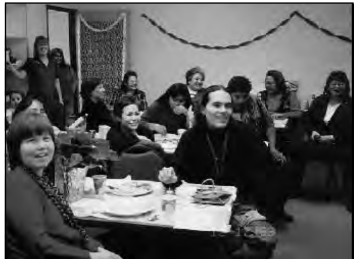
NPAIHB Staff and friends laugh as they review the categories to choose from.