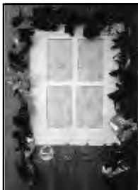
Elegant and Dreamy window