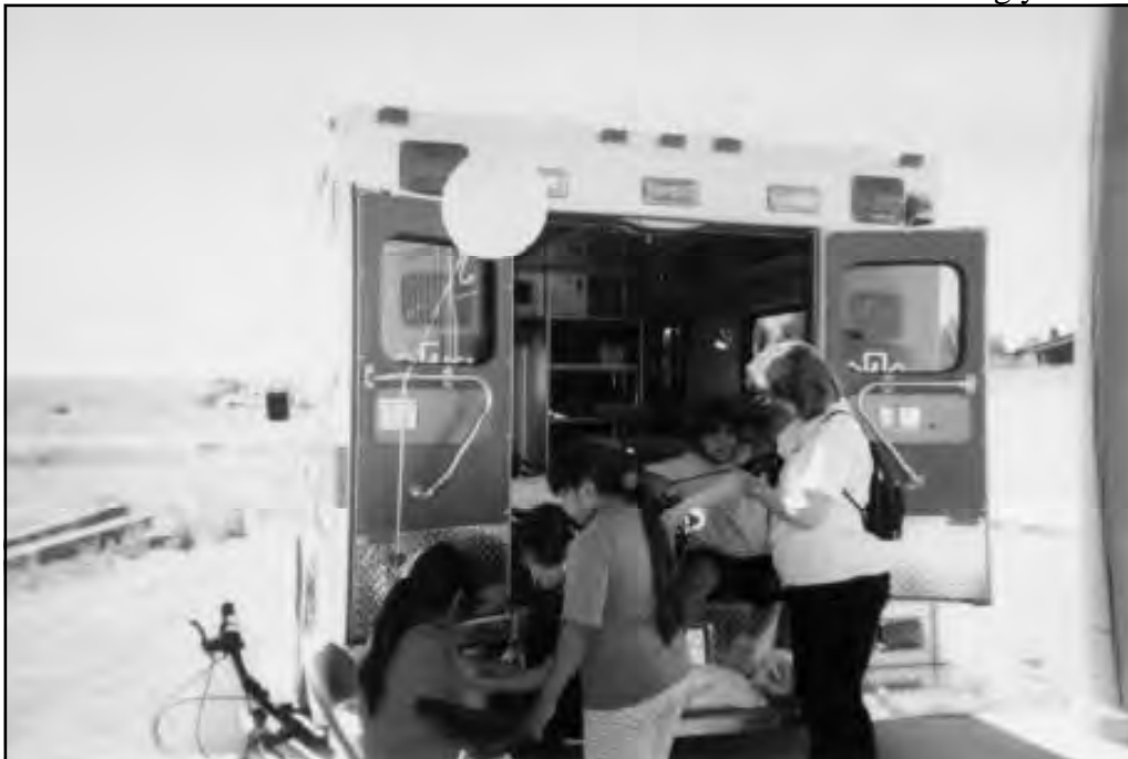
Burns-Paiute Youth learn about blood pressure and healthy lifestyles.