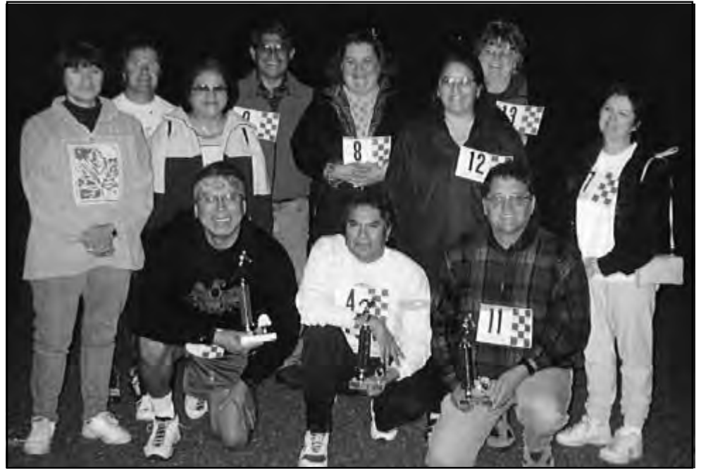
Participants in the Fun Run/Walk at the October NPAIHB Quarterly Board Meeting hosted by the Nez Perce Tribe.