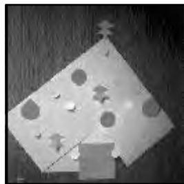
Picasso Christmas Tree