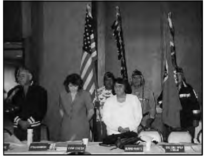
Presentation of Colors starting the Quarterly Board Meeting