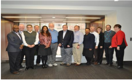
PHAB Board of Directors 2019