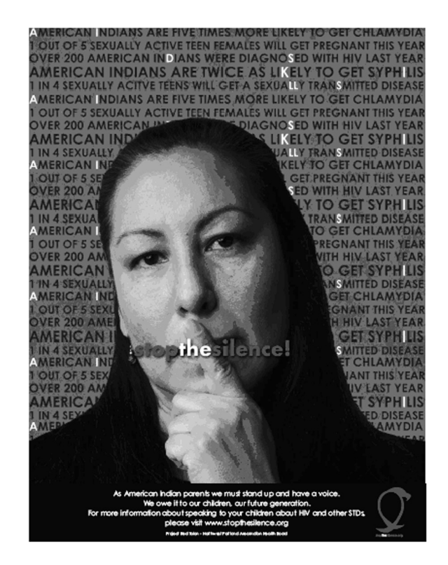
Health News & Notes • April, 2007• Page 11