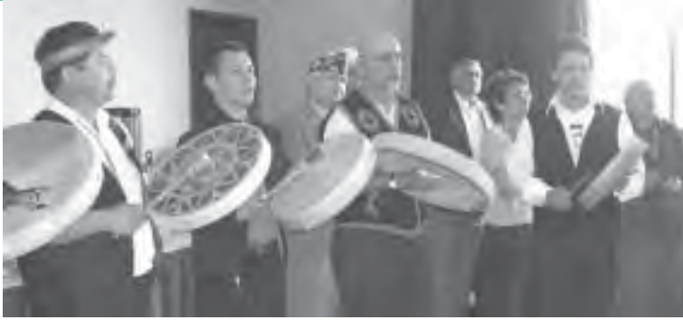
Makah songs to start the July 2004 QBM in a good way