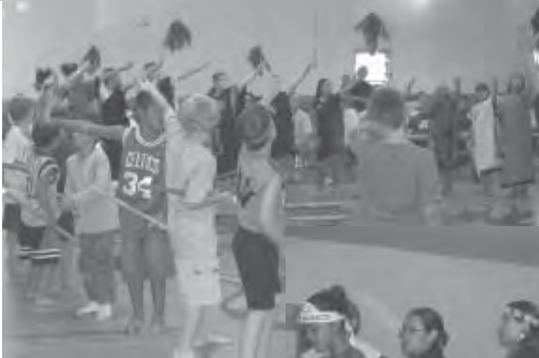
Makah youth dancing