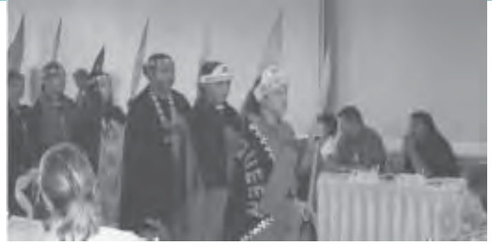
Makah dancers welcoming the July 2004 QBM Delegates and participants