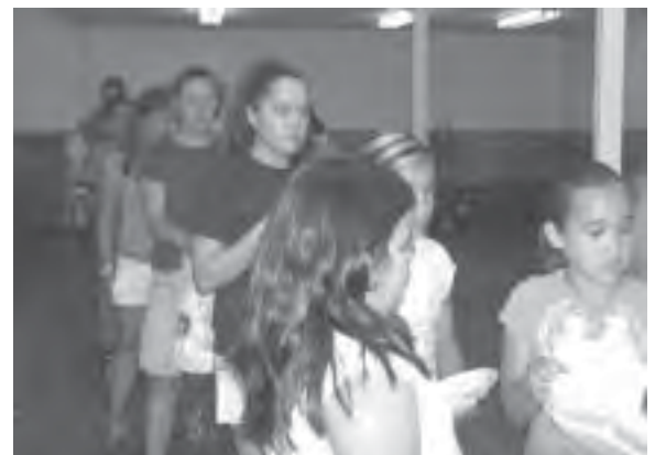
Makah girls delivering dinner plates to guests