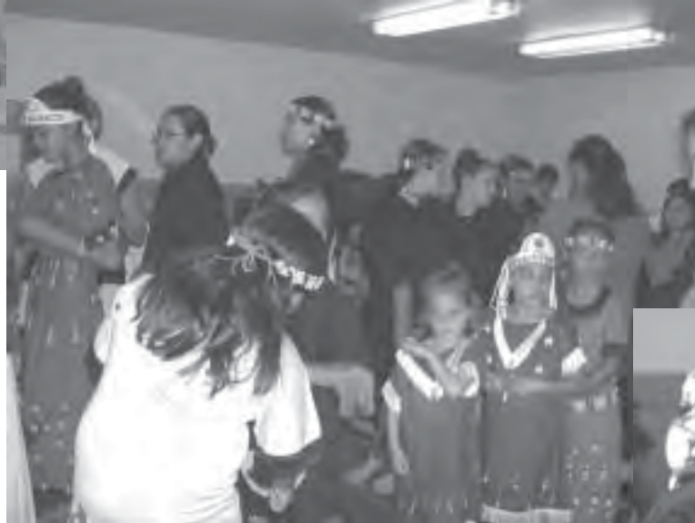
Makah girls preparing for a dance