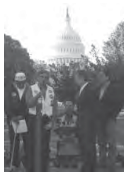
Navajo Code Talker presenting Senator Daschle with a Pendleton blanket