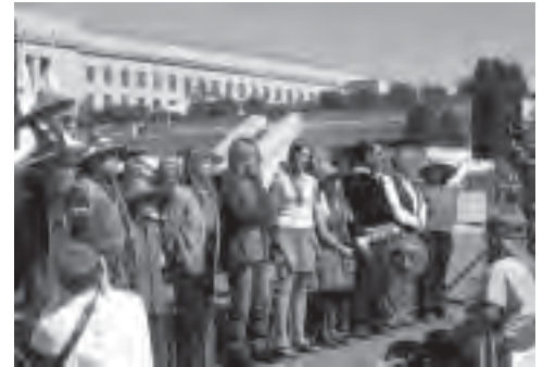
Lummi totem pole carvers