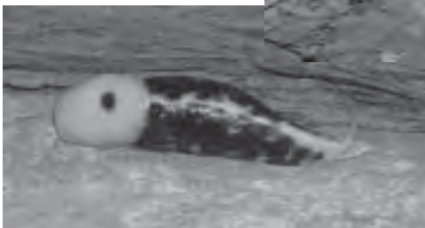
Slug on Cape Flattery