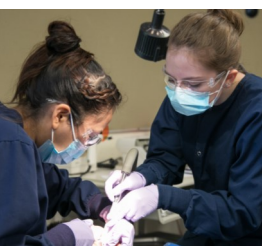
AK Dental Therapy Education Program Video

The Native Dental Therapy Initiative is excited to be partnering with We are Healers to feature dental therapists in a series of videos. We Are Healers is changing health disparities faced by American Indians/Alaska Natives by increasing the number of AI/AN health professionals who provide culturally appropriate, high quality health care to tribal communities.